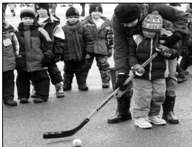
The Winter Olympics finally went off without a hitch! Please see page 5 for a special thank you to all.