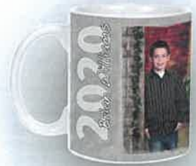
11 oz. Ceramic Mug

Package Includes: 8x10 (1), 5x7 (2), 2x3 Wallets (9)